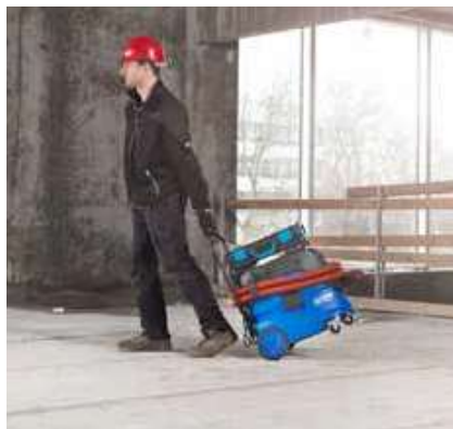
Robust and easy to handle. Convenient transport and flexible storage solution.