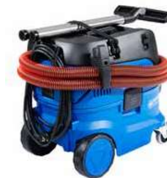
Combined hose and cable hook for easy and quick storage and flexible strap for fixation of power cord, hose and accessories and tools.