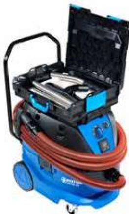
Optional storage box for accessories, extra filter and/or dust bags.